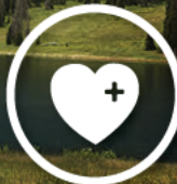
HEALTH & LIFE